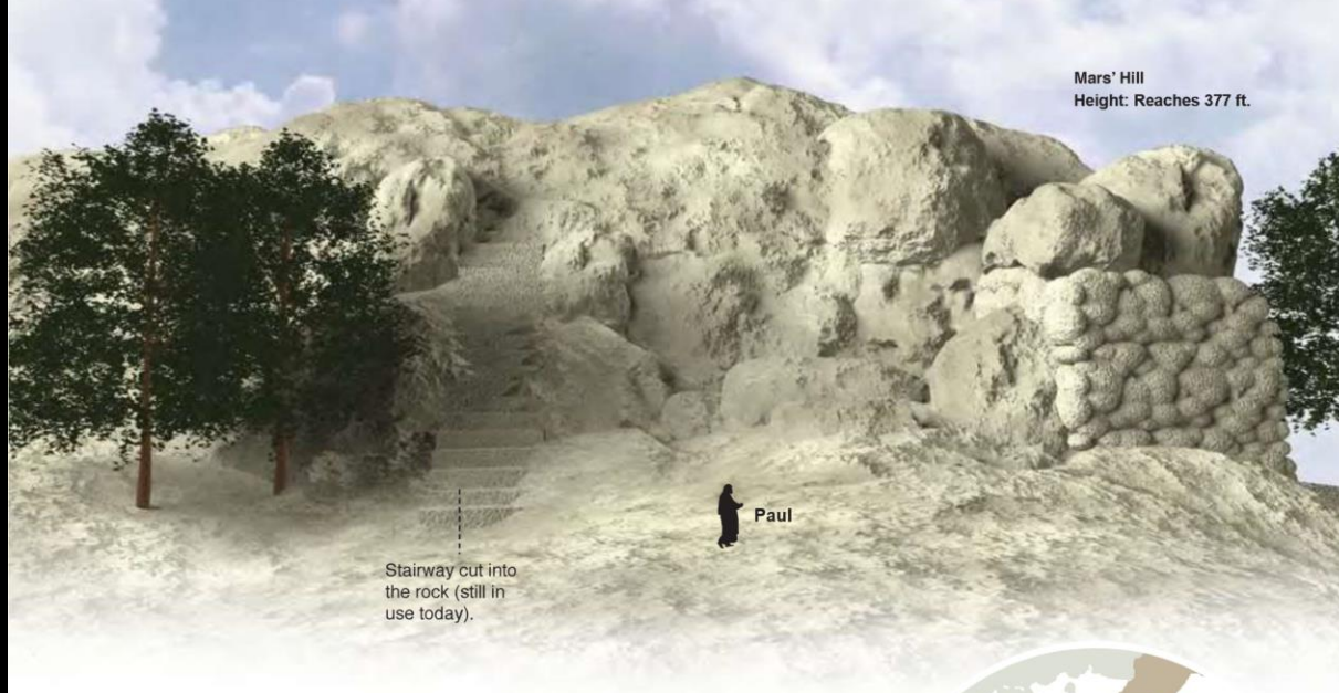
Stairway cut into the rock (still in use today).